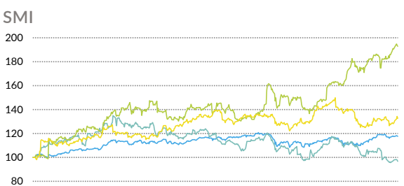
Dec 2016 Mar 2017 Jun 2017 Sep 2017 Dec 2017 Mar 2018 Jun 2018 -SMI -Dufry -Logitech -Richemont

The world economy continues to perform robustly. Risks such as a renewed flare-up in the trade dispute, the looming Brexit or the currency crisis in Turkey have as yet had little impact on global economic growth. Swiss companies are also the benefactors of this environment, which is expected to bring high sales and earnings growth for the year overall. The latter is even set to reach levels last seen in 2006. We prefer export-oriented companies such as Dufry, Logitech and Richemont. ( robol )